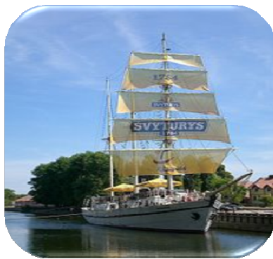
Sailing boat „Meridianas“

Klaipėda is the third largest city in Lithuania and the only sea-port of the country. Originally founded by Baltic tribes, the city was built by the Teutonic Order in 1252 and named Memel after a river 40 kilometers south. For most of its history, Klaipėda, was part of Prussia and later Germany before falling into Lithuanian hands after the First World War. The German heritage is still highly visible, but the sea-port status has seen the city blooming on its own.