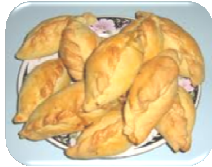
Trakai specialties „Kibinai“