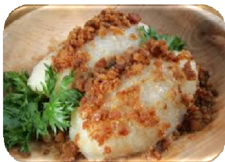
Mashed potato dumplings „Cepelinai“