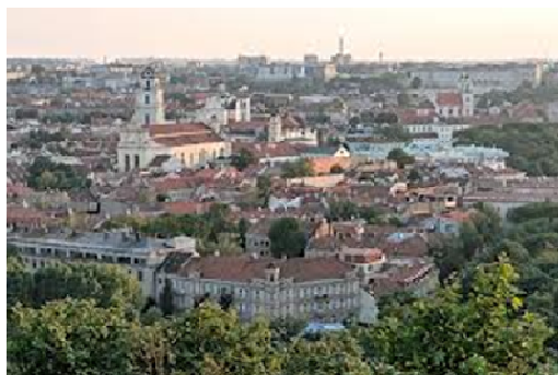
Vilnius old town

Trakai is considered the de facto medieval Lithuanian capital because Duke Vytautas the Great preferred the dreamy landscape punctuated by scenic lakes and islands over Vilnius. Trakai Castle is in the island, a red brick, fairy-tale fortress built by Vytautas and his father in the 15 th century to fend off German knights. Karaims, who belong to the oldest Turkish tribe—Kipchaks—who were brought from Crimea to Trakai in the 14 th century as bodyguards for the castle. Some families still live in Trakai today. Visitors like to learn about their culture and try traditional Karaite specialties, such as kibinai or chebureki (savory meat pastries).