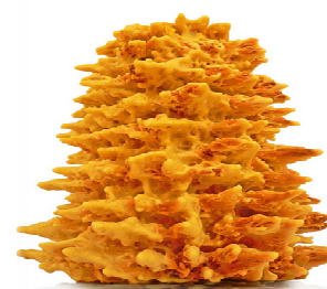
Wedding cake „Šakotis“