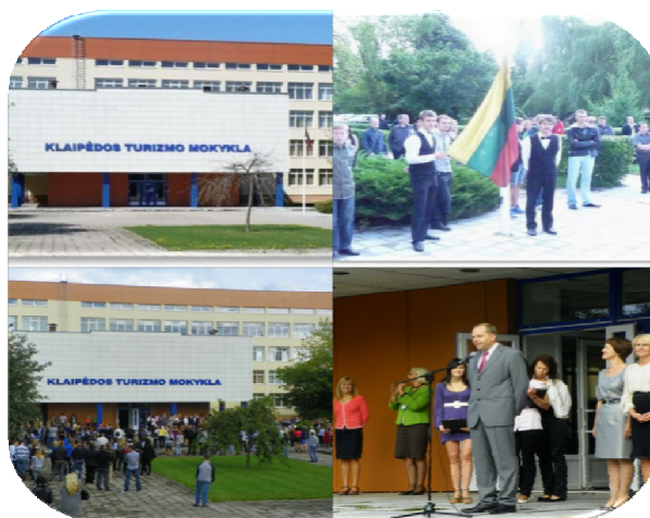
Klaipėda Tourism school on the first of September

Time zone: Lithuania is seven hours ahead of U.S. EST. When it is 6am in New York, it is 1pm in Vilnius.