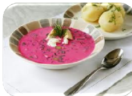
Cold red beet soup „Šaltibarščiai“