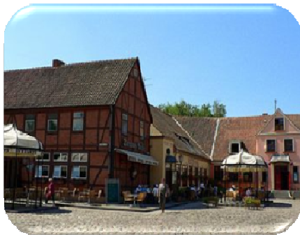
Klaipėda Old Town