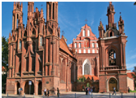
„St. Ann“ church