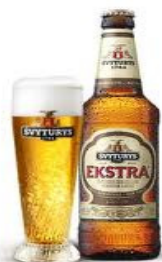
„Švyturys“ beer „Extra“